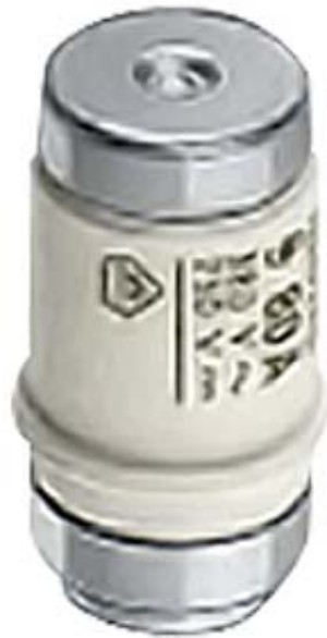
NEOZED FUSE LINK 400V GL, SIZE D02, 35A IN FOLDING BOX