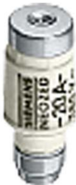
NEOZED FUSE LINK 400V GL, SIZE D01, 16A IN FOLDING BOX