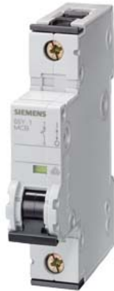
CIRCUIT BREAKER 230/400V 10KA, 1-POLE, C, 10A, D=70MM