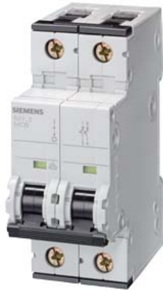
CIRCUIT BREAKER 400V 10KA, 2-POLE, C, 2A, D=70MM