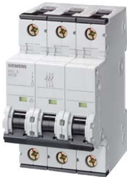
CIRCUIT BREAKER 400V 10KA, 3-POLE, C, 40A, D=70MM