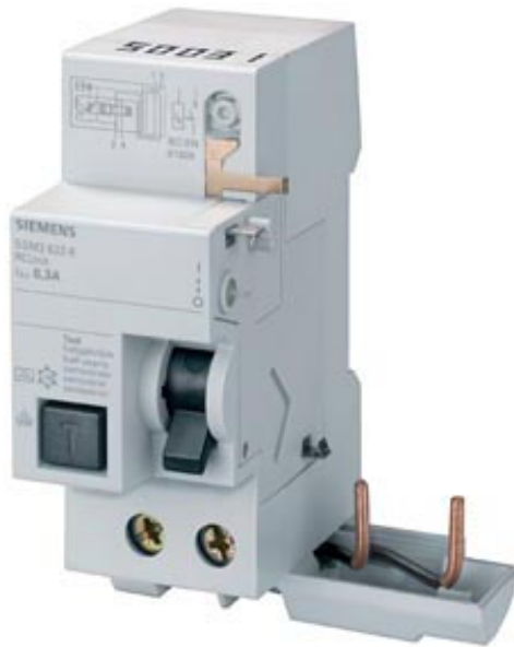
RC UNIT FOR MCB 5SY TYPE A (PSE/SSF), T=70MM 0.3-40A 2POLE IFN 0,3A 230V