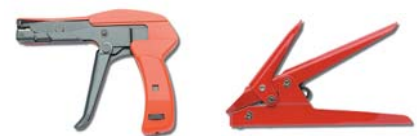
Tools for cable ties, see pages 120-121.

Our cable ties are constantly tested in our laboratories following important international standards. Particular extreme cable ties uses, weather conditions or even unsuitable applications might nevertheless vary some of the data we declare. Therefore, in case of specific enquiries or problems, do not hesitate to contact us. We will be pleased to share our experience with You.