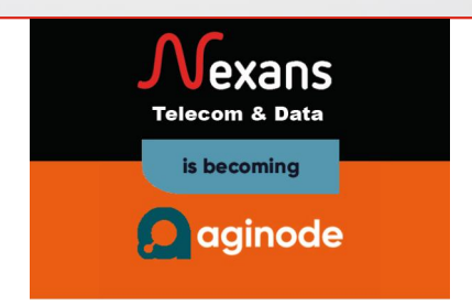
You may see a combination of brands on documents or products during the transition.