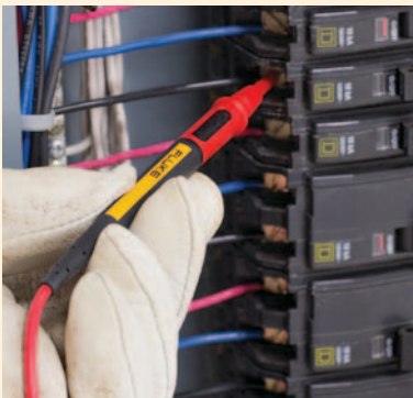
Reduce tip exposure for CAT III testing