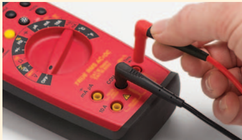
Universal plugs compatible with all 4 mm shrouded inputs