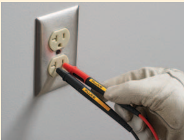
Increase tip exposure for CAT II probing