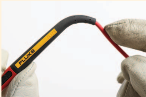
Extreme strain relief tested to withstand over 30,000 bends