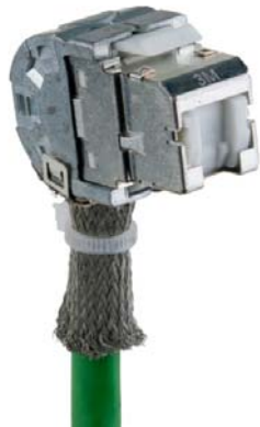
3M™ K6A RJ45 STP Jack