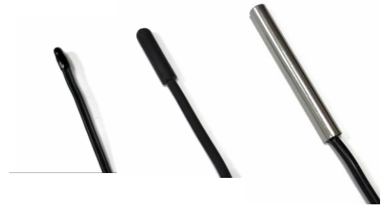
Figure 1. ZACNTC/E/F/S