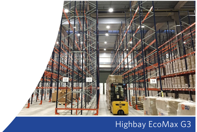
Highbay EcoMax G3